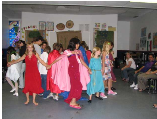
Students enjoy a Greek folk dance at Greek Night.