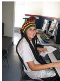
Students enjoy Spirit Week at Sidney